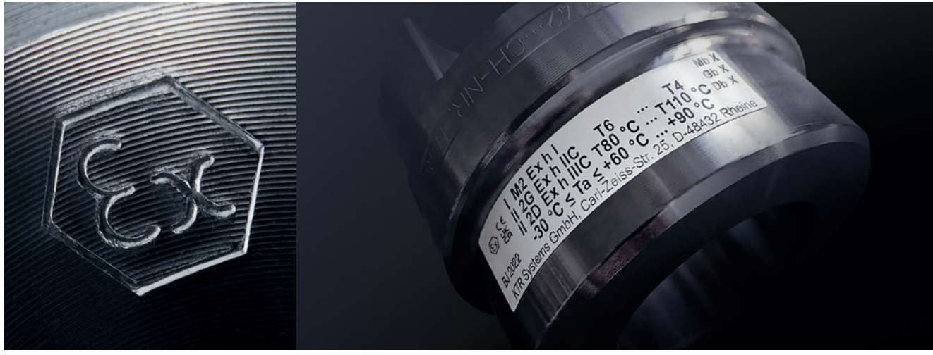
Example of explosion protection marking on the \mathsf{ROTEX}^\circledast jaw coupling

Explosion protection KTR components bear an explosion protection marking as follows: